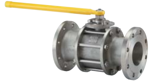
RA 66 CBF DN100

3 Piece ball valves with ISO top flange DN65 - DN250 Butt weld, threaded, socket weld and flanged version